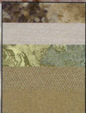
Silver Sand Fabric Combination

If you enjoy a beautiful and comfortable living room, then what you're looking for is the Allegro Bus. This motor coach comes equipped with a FlexSteel® Ultra Leather driver's and passenger's seat, cloth sofa, and either a FlexSteel® recliner or a FlexSteel® Ultra Leather love seat.