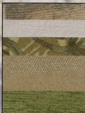
Spring Breeze Fabric Combination